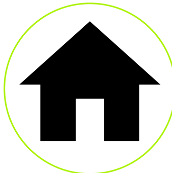
Property Tax Statement