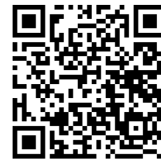
Scan to for online card registration