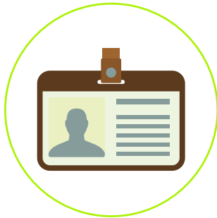
Up-to-Date State ID