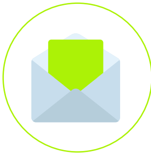
Pay Stub Issued in last 90 days